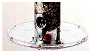
Seed Tray 7 1/2 inch (A-6s, THs, XLs, Mini)