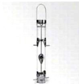
Sunflower feeder with Ring Pull Silver 6 port