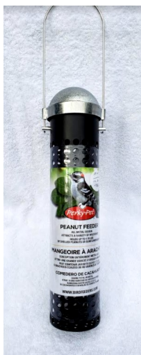
Perky Pet all metal Peanut feeder $18.00/$16.20 + tax