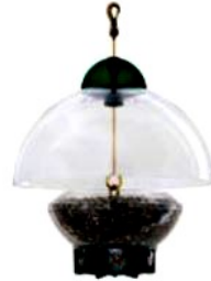
Big Top Bird Feeder New Green Parts