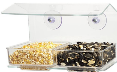
Window mount Double seed trays, suction cups included. $22.75/20.50 + tax May be the last time available to buy!

Please return this form along with your seed order form to JAN BRESNAHAN NO LATER THAN NOV. 1 st . The address is on the seed sale order form on page 6. Payment methods are on page 5. You may pay ahead or at the sale. Masks required!