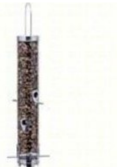
20 in. Tubular DYB7F

B7 20 Inch $87.50/$78.75 + tax. May be on back-order