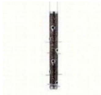
Executive Tubular 30 in. Feeder