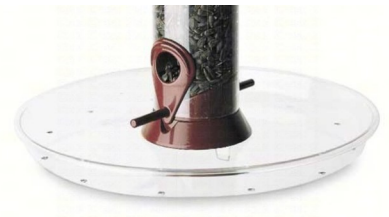
Omni Large seed tray $15.00/$13.50 + tax