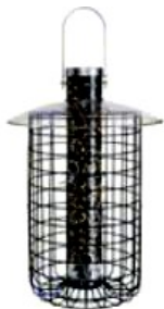
B7 Domed Cage Feeder