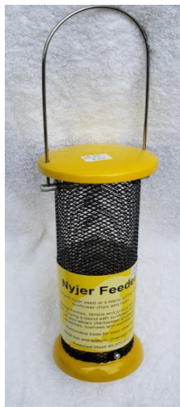
Metal Thistle Feeder $10.00/$9.00 + tax