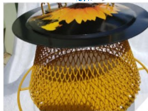
Wire mesh Single "No-No" Feeder $24.50/$22.00 + tax