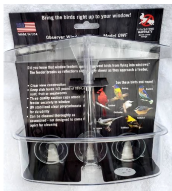
Observer Window Feeder Attaches to outside of window. OWF— $17.80/$16.00 + tax